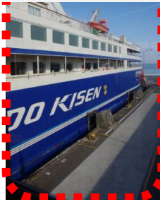
Sado Kisen Terminal Building